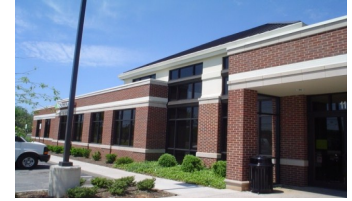
Building Facades Interior Water Infiltration