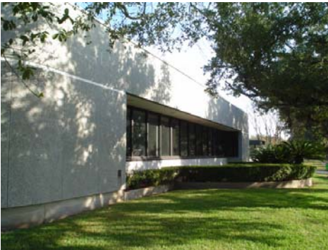
Regions Bank League City, TX

After severe spring storms in the St. Louis, MO area, Lodging Hospitality Management asked Foresight Services to perform roof inspections on the Ballpark Hilton, Westport Sheraton and Chalet, and the historic Union Station Hotel and Train Shed. Photographs in the survey reports provided documentation and extent of hail damage.