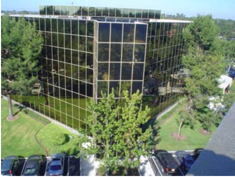
Healthcare Realty Fountain Valley, CA

Foresight is providing Design-Build services for a façade renovation at two large office buildings on the west coast. The scope includes all gold colored glass and mullions, coping caps, drive canopies, and parapet walls. A new window film is being installed to improve condition, appearance, and efficiency.