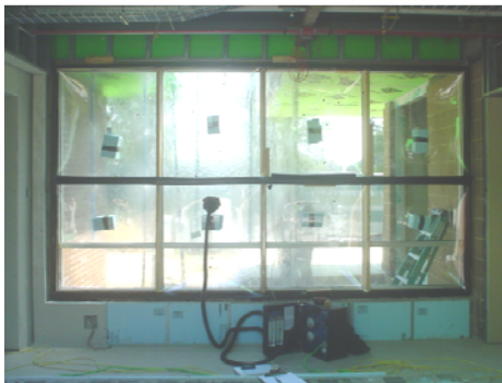
Jefferson Barracks Cemetery St. Louis, MO

Inspection of damaged façade from Hurricane Ike detected cracks and deterioration in the aggregate panels from moisture infiltration. At the request of CB Richard Ellis, Foresight developed a repair scope of work for a replacement EIFS system. Installation is underway and is being performed after hours to allow the bank to continue operations.