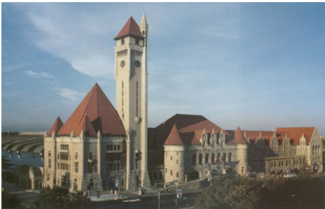
Union Station St. Louis, MO

Foresight is providing Design-Build services for a façade renovation at two large office buildings on the west coast. The scope includes all gold colored glass and mullions, coping caps, drive canopies, and parapet walls. A new window film is being installed to improve condition, appearance, and efficiency.