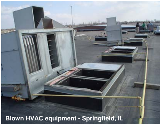
Blown HVAC equipment - Springfield, IL

Disasters happen - minimize disruptions to your business. Damage to your critical building components will be resolved by qualified, experienced professionals working with your best interest in mind.