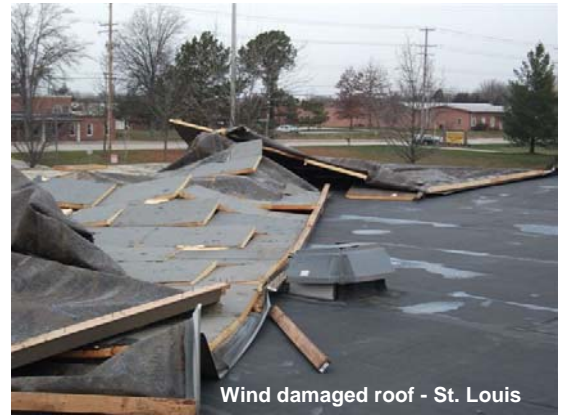
Wind damaged roof - St. Louis