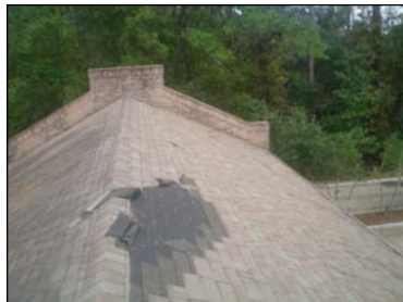
Damaged shingle roof Baton Rouge, LA

Our project managers headed into hard hit Louisiana & Texas to assist our client, C.B. Richard Ellis, with property management of Regions Banks that were affected by Hurricanes Gustav and Ike. By using the base camps set up by CB Richard Ellis with temporary services (gasoline, electricity, and housing), we were able to conduct business in areas where basic necessities were not readily available.