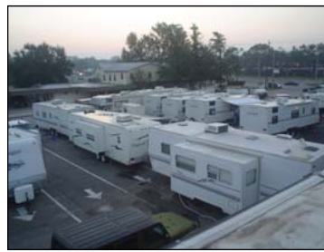
Sunrise at Base Camp Tomball, TX