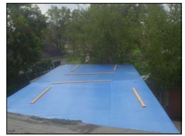
Blown off flat roof Thibodeaux, LA