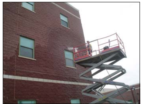
Belleville West High School Belleville, IL

Roof survey and design for 17,000 sq' roof covered with pyramid and hexagon projections, and numerous skylights.