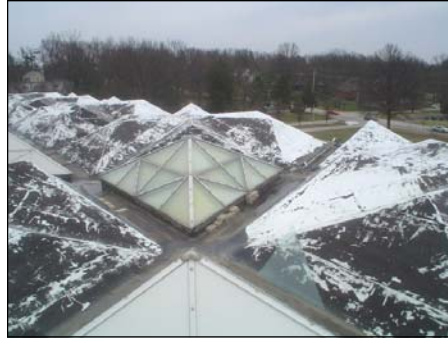
Congregation Temple Israel St. Louis, MO

Roof survey and infrared scan on 387,000 sq' industrial plant, that identified total percentage of wet insulation for re-roofing project.