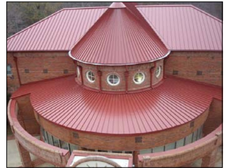
Regions Bank Peachtree City, GA

Green Roof design utilizing tray system on white TPO for new theatre. Project management and punch list report at completion.