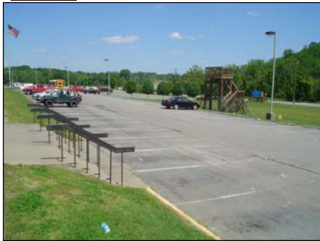
Sumner County School District Hendersonville, TN

Parking lot surveys at two schools with concrete, asphalt, and gravel surfaces and over 615,000 sq' area.