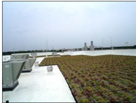
Kerasotes Theatre Chicago, IL

Parking lot surveys at two schools with concrete, asphalt, and gravel surfaces and over 615,000 sq' area.